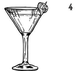
Espresso Martini Vodka, Espresso, Kahlua