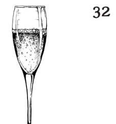
Sparkling Pack Strawberry Fields, Peach Bellini, Swan Passion