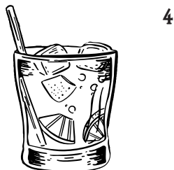
Negroni Gin, Bitter Berto, Vermouth Rosso