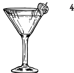
Passionfruit Martini Passionfruit Infused Vodka, Passoa, Lime, Vanilla