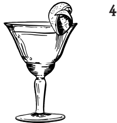
Raspberry Margarita Tequila, Cointreau, Raspberry