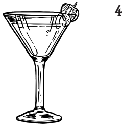
French Martini Berry Vodka, Cassis, Pineapple, Raspberry