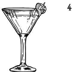
Cosmopolitan Vodka, Cointreau, Lime, Cranberry