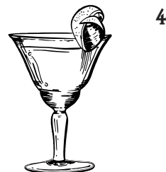
Classic Daquiri Rum, Lime, Sugar