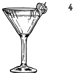
Lychee Martini Gin, Lychee, Aperitivo, Lime